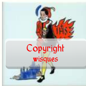
LOUIS DE GONZAGUE